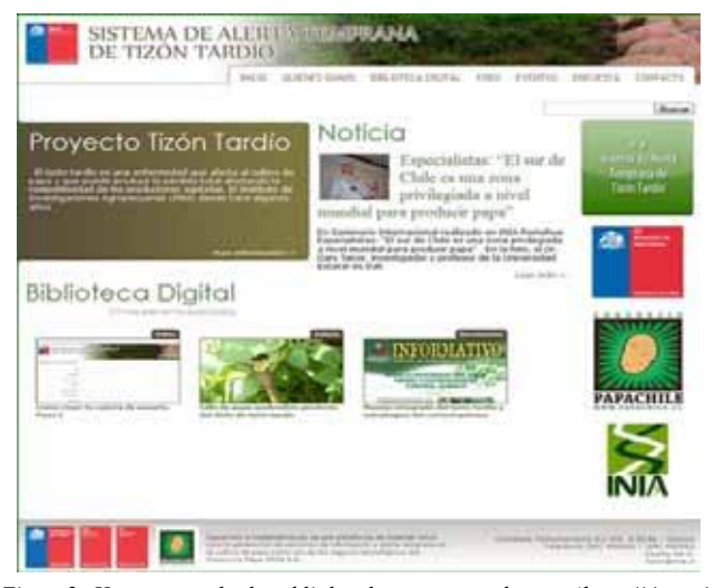
Figure 2. Home page the late blight alert system web page (http://tizon.inia.cl)

Corresponds to home page of the website (figure 2) and contains sections where users can find information about late blight and Phytophthora infestans . Here are present the following sections: Documents and photographs: corresponding to publications by INIA for the divulgation of different topics for the recognition of symptoms, integrated management, strategies evaluation, etc.