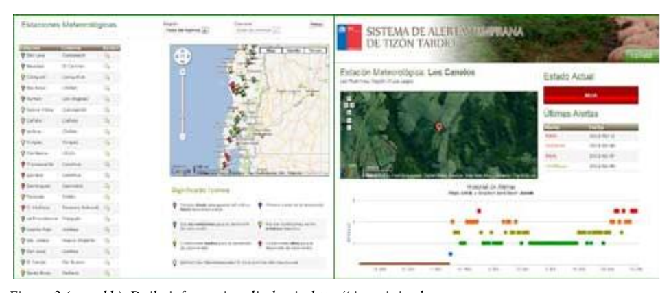
Figure 3 (a and b). Daily information display in http://tizon.inia.cl.

Another way to visualize the information is as indicated in figure 3 (b), where it is possible to observe the conditions for the development of late blight through out the season and for every meteorological station that is chosen. In the bottom axis it can be seen the dates from the start of the season and every color indicates an alert category in the same way as described before.